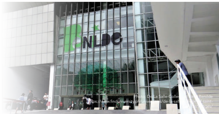
Photo: De La Salle College of Saint Benilde https://www.finduniversity.ph/universities/de-la-salle-college-of-saint-benilde/images/